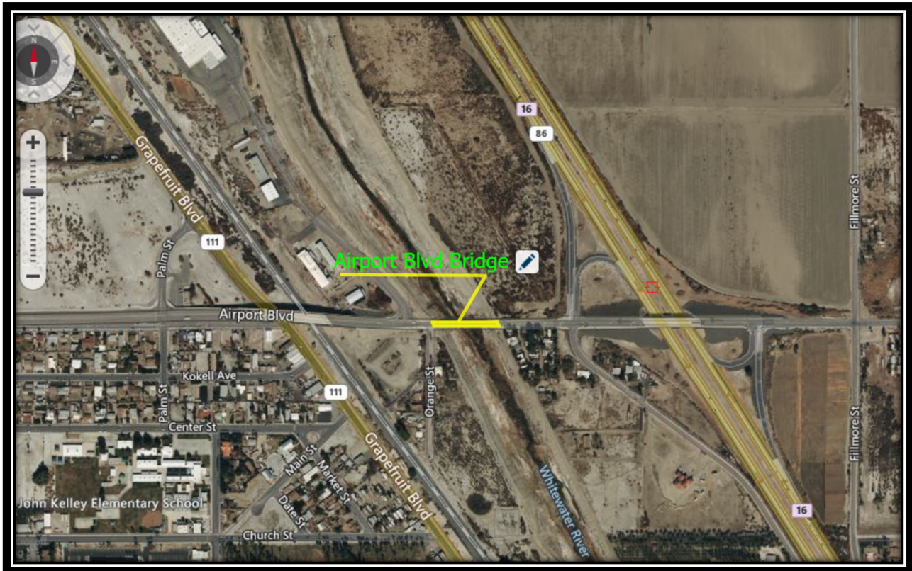
Vicinity Map: Airport Blvd Bridge Over Whitewater River

Airport Blvd. Bridge Replacement at Whitewater River Bridge Replacement Project (Bridge No. 56C-0020), Federal Project Number: BRLS-5956(231)